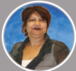
Ald Margie Sampson Executive Deputy Mayor Agrn-Parks Disabled

execmayor@capewinelands.gov.za 072 949 5922 Tel. 021 870 3203 or 021 870 3233