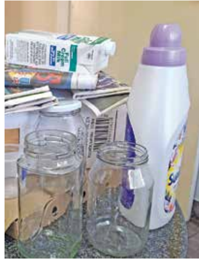
Waiting for the drop-off: In a few years, residents of Fisantekraal will also enjoy convenient access to a City drop-off for the easy disposal of their recyclable waste.

On completion, the drop-off will receive recyclable materials such as paper, plastics, glass and metals, as well as garage (mixed) waste, e-waste and builder's rubble. Progress updates will be shared with the community as the project advances.