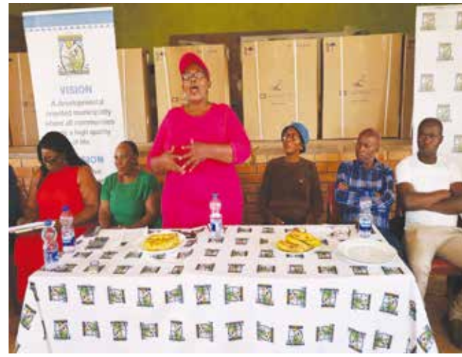
Indawo yolonwabo egcweleyo, apho iindwendwe zazirhabula kwaye zizonwabisa ngelixa bonwabele umgca.