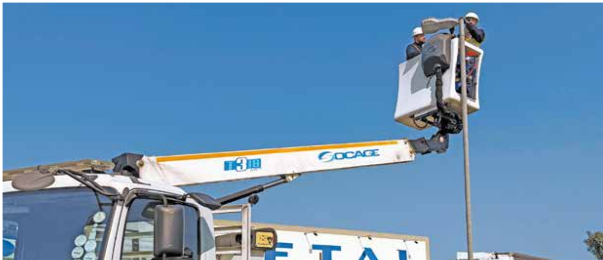
Lighting up Area North: The light-emitting diode (LED) upgrade and replacement project is part of the City's continued investment in electricity infrastructure, ensuring that communities benefit from reliable services that are both modern and cost-effective. Ongoing maintenance of electricity infrastructure also improves safety for communities and road users. Several streetlights in Kraaifontein (pictured above) were upgraded to LEDs, while critical infrastructure maintenance was undertaken at the same time.