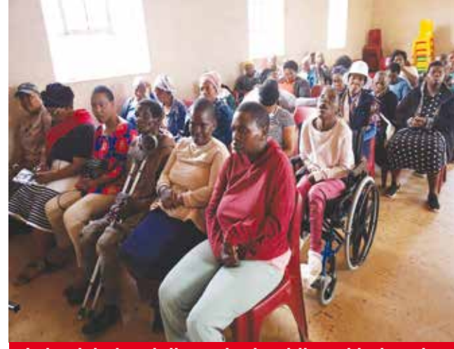
Iwheelchair ezinikwe abo baphila nokhubazeko eNtsikayethu.