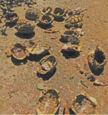
Chilling discovery: Only empty shells were left after poachers killed 19 angulate tortoises at the Table View nature reserve in November.

See something, say something While staff conduct regular patrols at all City nature reserves, we also call on visitors to report any suspicious activity or behaviour.