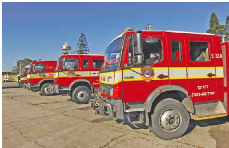
Report any fires or other risks to life or property to the Public Emergency Communication Centre on 021 480 7700. For fire safety tips, enter 'Fire safety' in the search box on www.capetown.gov.za .

In terms of the Festive Season Safety Plan, fire crews will be on duty 24/7 at all 32 City fire stations to deal with any type of emergency. Aerial firefighting support in the form of two Huey helicopters will be available from 1 December. Other resources include a fixed-wing light spotter aircraft to assist the command and control centre during veld fires, as well as 96 dedicated wildland firefighters, who will be strategically deployed to cover areas prone to runaway vegetation fires.