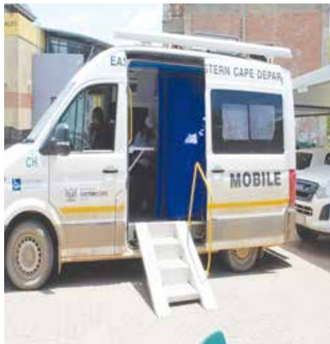
Uluntu luxhotyiswa ngesifo ugawulayo