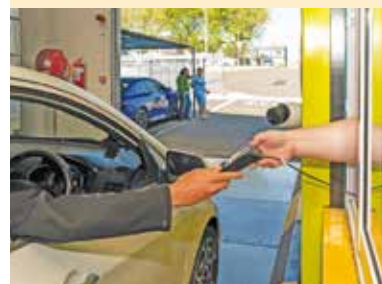
One new licence disc coming up: A cashless drive-through facility for vehicle licence renewals is one more way in which the City is making its services more accessible.

This is another innovation aimed at making transacting with the City easier. It follows the successful launch of the online booking system for key municipal services.