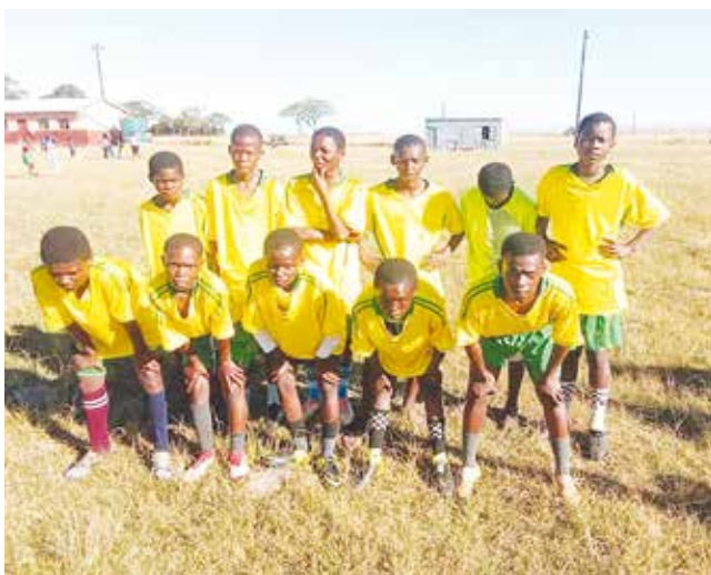
Amanye wamaqela amancinci alindeleke ukuba adlale kwiMqanduli League Football Association kunyaka ozayo.

Uthe oko basungula ileague yabo zange banabo abaxhasa abancedisayo ukuthenga izinto ezifana neebhola, kiti, ibhola nangona