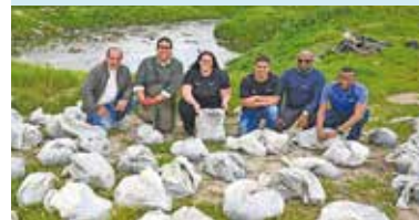
Got river clearing in the bag: The City-funded Litterboom Project bags the litter intercepted by their litterbooms in a number of Cape Town's rivers every day, as shown here along the Black river. The waste is sorted, and recyclable plastics are converted into valuable goods.

As part of its project plan, the non-profit has also expanded its operations to support a circular economy. They take plastic pollution in rivers, sort it, and convert it into raw material for the production of useful items that can be reused or sold. At their Innovation Hub, recyclable plastic is transformed into commodities and everyday household items. The proceeds are reinvested into initiatives to keep waterways clean and sustain local reclaimers.