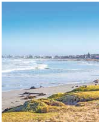
Flying the 'flag of fabulous': Melkbosstrand is among the eight Cape Town beaches that have secured Blue Flag status this summer, certifying their high standards.