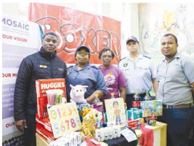
Boxer donated much needed care items for the Mitchells Plain SAPS Victim Friendly Facility.