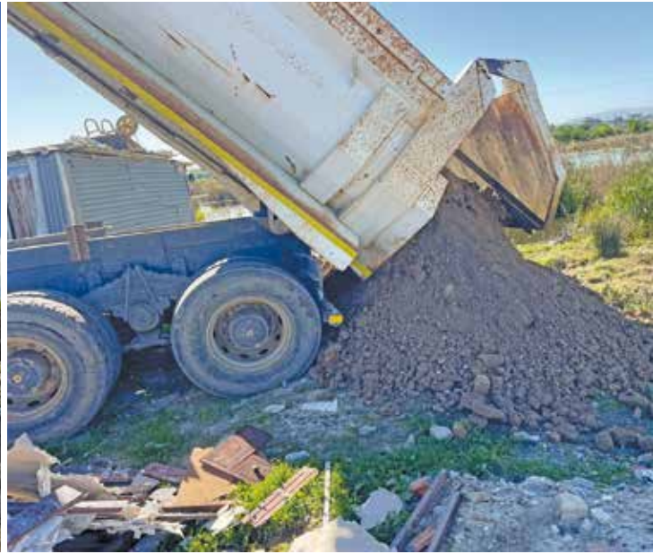
Caught in the act: The City calls on residents to help it clamp down on those who brazenly carry on dumping waste illegally on empty sites across the metro.